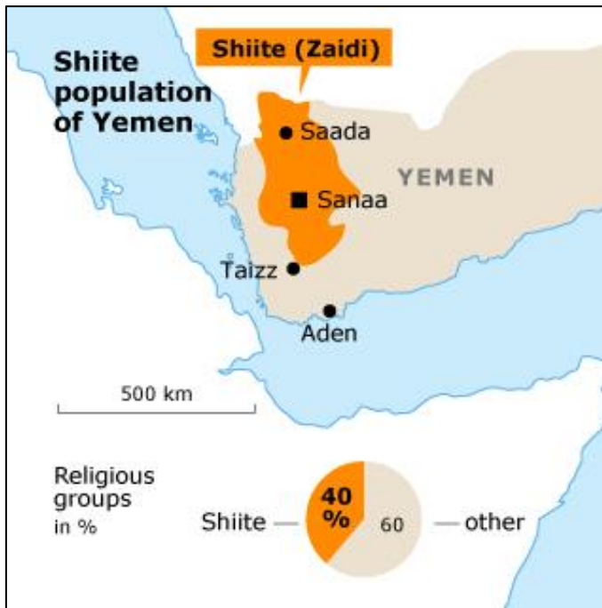
Figure 2. Geographical stationing of Shiite Population of Yemen

Unlike Saudi Arabia, Iran's political presence in Yemen was not full of evidence as they are in Iraq, Bahrain or Kuwait. Till this day, a challenge in tracing Iranian direct involvement in Yemen's Sa'dah wars or the current civil war remains. With the found evidence, Iran's interest in Yemen is most likely, particularly during the final phases of the Sa'dah wars. Particularly, after the U.S. invasion of Iraq and the execution of Saddam Hussein, interest could be intensified after Shia government ascended to power in Iraq leaving Iran with the more reason to exploit another ally in the Middle-East.