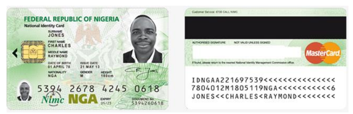
Figure 3. Sample of the Nigerian E-ID Card.

the use of finger print. Once this is done, the healthcare providers will be able to use the unique identifier on the ID card to link patients directly to their health data just as it is done in the developed world. A sample of the Nigerian E-ID card is shown below.