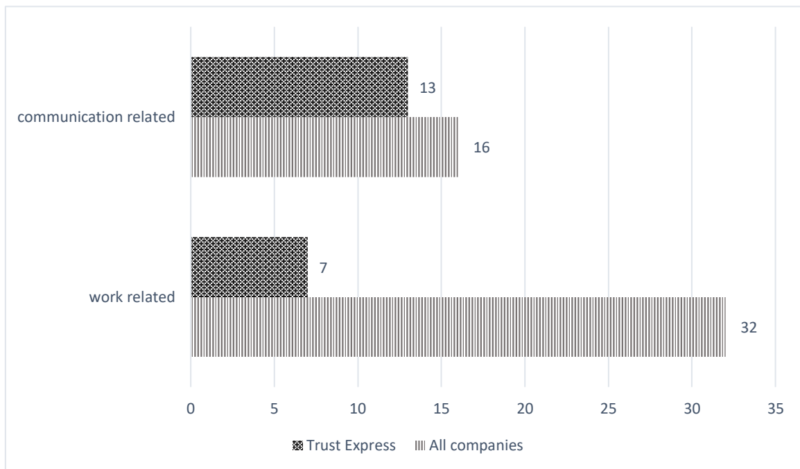
Figure 2. Results regarding ethics rules

There is another questions and group of answers. So, based on the answers given on second question Figure 2 is built below and there are shown difference in business rules adjusted in working area. There is also a comparison between Trust Express and all companies and answers respectively divided by two groups.