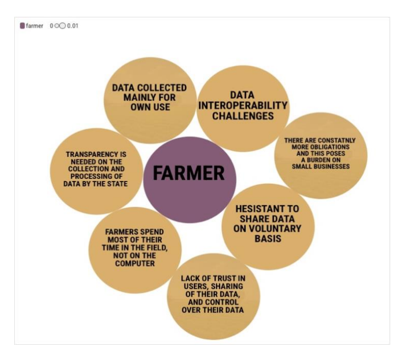
Figure 2. Key challenges in visualised form, based on information from farmers.