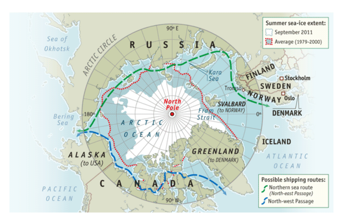
Figure 4. map of the trade routes in the Arctic