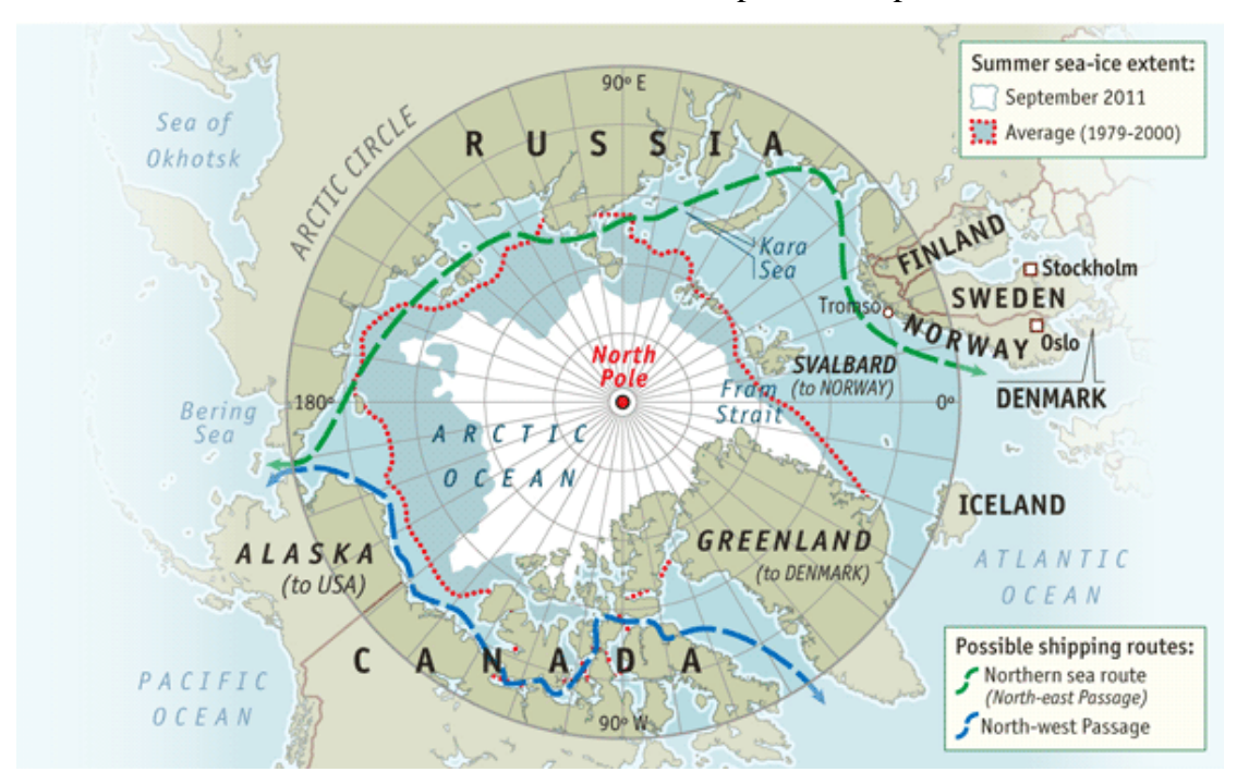
Figure 4. map of the trade routes in the Arctic

If there would be established trade routes through the Arctic, they would significantly affect trade between the Arctic states, and create a possibility for the Arctic states to acquire an advantage as export and import harbors. However, the opening of these trade routes has been strongly questioned due to the environmental effects the cargo vessels would have in the Arctic Ocean. For example, Green Peace has been quite strongly against the vessel traffic, oil drilling and fishing in the Arctic Ocean (Save the Arctic 2016). This is one issue that the Arctic states could cooperate on. Finland has the best liquefied natural gas (LNG) technology in the world and would be able to build cargo vessels with LNG technology, which would be more environmentally sustainable than vessels equipped with petrol engines. If the Arctic routes use would increase and the use of vessels with LNG engine would be used in those routes that would reduce the environmental impact in the Arctic Ocean as well as it might reduce the sea traffic in other sea routes, which would also have a positive impact in other seas and oceans.