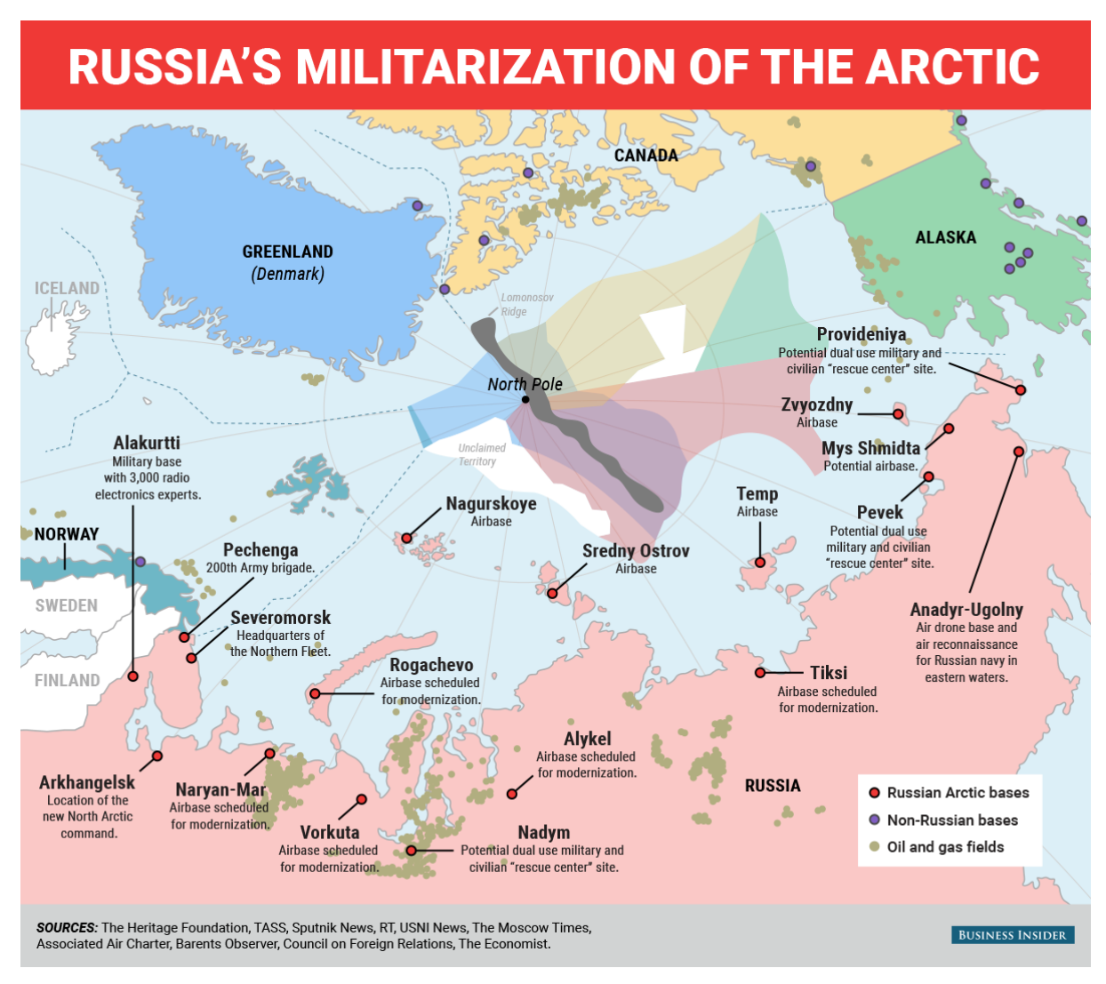
Figure 3. map of militarization in the Arctic (Bender, Nudelman 2015)

As can be observed from Figure 3 above, Russia has multiple military bases in the Arctic and the importance of those to Russia can be seen from the map. Most of Russia's military bases are close to oil reserves or are protecting Russia's passage in the Arctic. Compared to the non-Russian bases the purpose of Russian bases is significantly obvious. The non-Russian military bases are mostly located in the mainland for example Alaska, Norway and Greenland which have military bases inside their mainland borders. Whereas Canada and Russia have military bases on islands and at the Arctic Ocean. Canada as well has military bases nearby an oil reserve, which shows the same underlined motive to protect their interests; securing the North-West passage and their rights to the oil reserves.