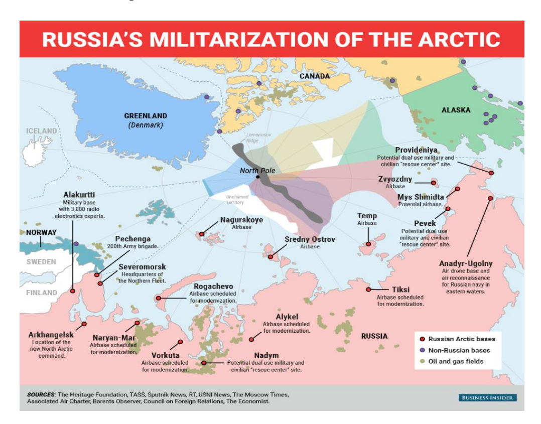
Figure 3. map of militarization in the Arctic (Bender, Nudelman 2015)