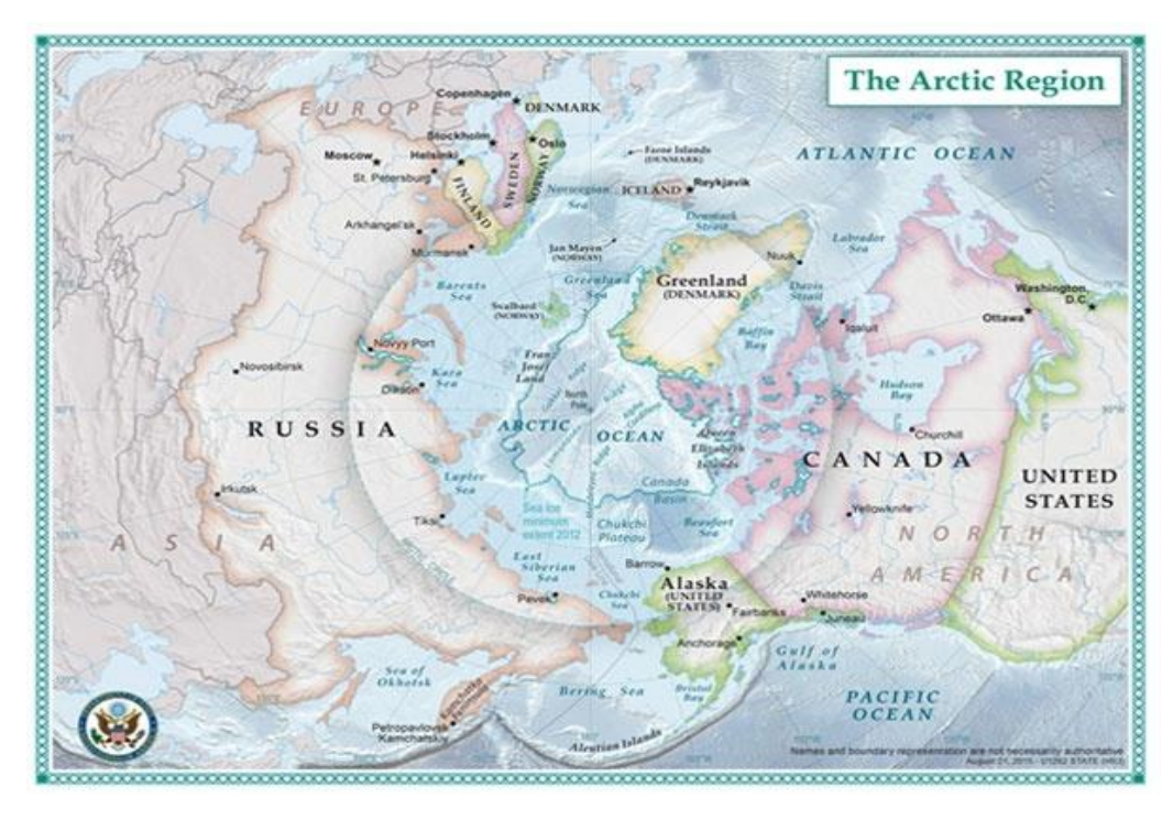
Figure 2. Map of the Arctic Region