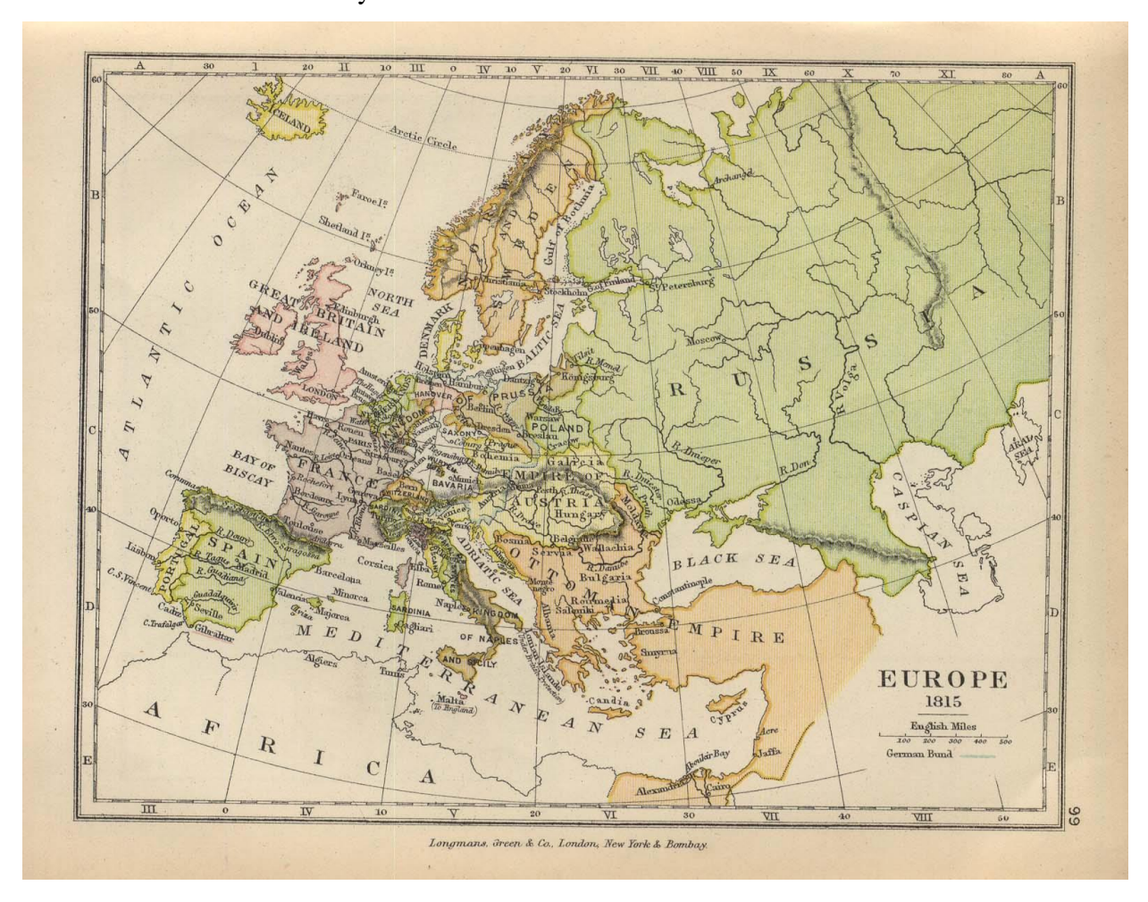
Figure 1. 1815 map of Europe

which then was part of Danish-Norwegian Kingdom, to Sweden. However, Iceland and Greenland stayed part of the Kingdom of Denmark, which meant that Denmark remained in the Arctic region but their land territory was significantly smaller (see Figure 1). The change in that time was not significant, however the change gave Sweden better access to the Arctic region. Some may argue that Sweden losing Finland to Russia in 1809 (Hayes, Cole 1949, 159) is significant to the dynamics of the Arctic region, however the land mass and the coastal line Finland had in the north cannot be compared to Norway's land mass and coastal line. For this reason, it can be claimed that Finland coming under the Russian rule did not have a great or real influence on the Arctic dynamics.