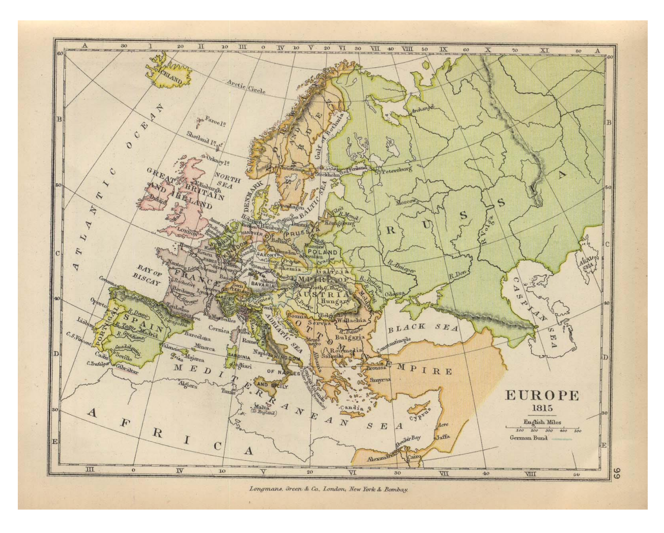
Figure 1. map of Europe 1815