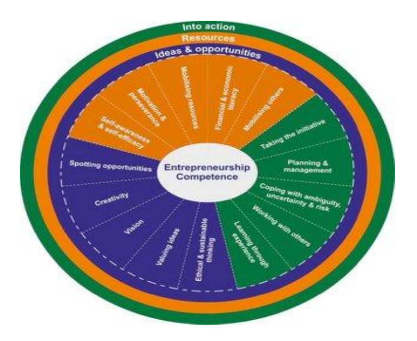
Figure 1.1. EntreComp Competence Framework, 2016

"Actions" is the third area of entrepreneurial competencies in the EntreComp model. It deals with the ability to motivate others, take initiatives, plan, manage, make decisions, deal with uncertainty, teamup, collaborate, and learn through experience.