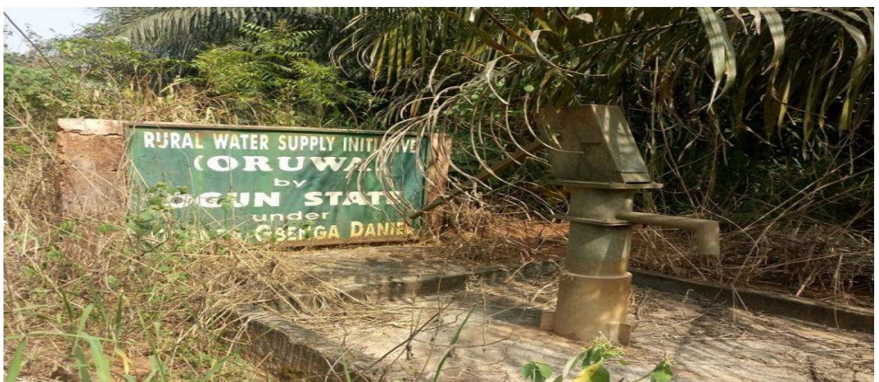
Figure 4: An abandoned faulty tap at Sawonjo settlement.

According to Obayelu (2020) incessant civil unrest and insecurity destabilizes most farm settlements and impede realization of its core objectives. The Nigerian civil war that lasted for