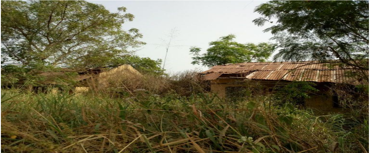
Figure 2: A dilapidated house at the Sawonjo farm settlement.

cost of continued implementation of the policy which gradually becomes too expensive and unsustainable over time as a result of uncontrolled inflation rate and increase in the number of people who want to participate in the program and this usually result in the collapse of the policy (Idachaba, 2006). Unfortunately, all these are not usually considered during the formulation and implementation of the policy as there exist no long term projection which can accommodate unforeseen future circumstance (Olatunbosun, 1971).