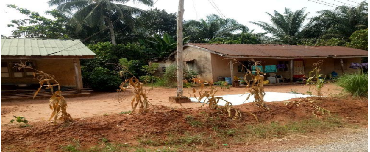
Figure 3: Poor housing at Sawonjo farm settlement Nigeria.